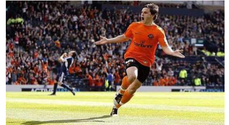
9. Scottish Cup