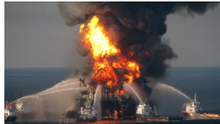
5. Oil Rig