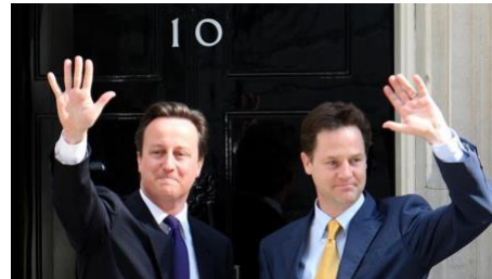
8. David Cameron