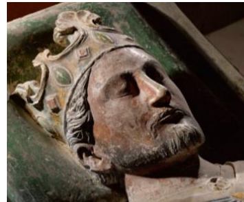
Richard the Lionheart