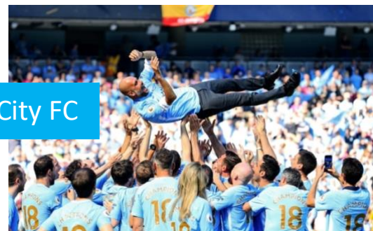
Manchester City FC