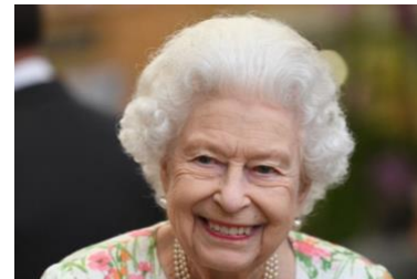
HM The Queen