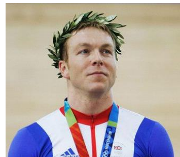
Sir Chris Hoy